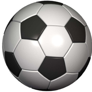
Sports, scholarships or life in Christ. What's the priority?

“Finally, brothers, whatever is true, whatever is noble, whatever is right, whatever is pure, whatever is lovely, whatever is admirable— if anything is excellent or praiseworthy— think about such things.” Philippians 4:8