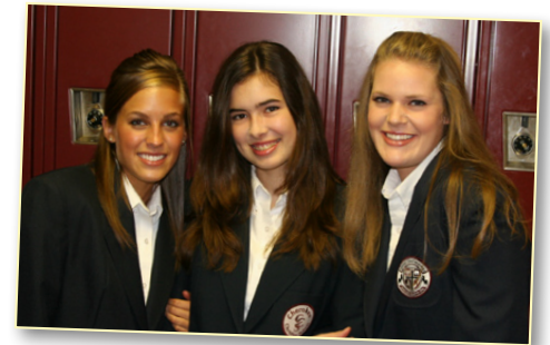
When my child leaves the home, for college or work, have I done all I can to arm them with the tools for life, or have I left that up to the government system...?

The hearts and minds of our children and the future spiritual condition of our country await your answer.