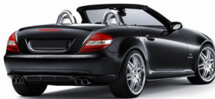
“Material temporal things, or an education for my child that incorporates the things of eternal value?”

However, the word to consider here is “priorities.” People always do what is important to them. The question is: are the things that are important to God the same things that are important to His people? Educating children in a Christian way is one of the Bible’s most important messages. A Christian education for our children must be a priority. Choosing to downsize the home, limit entertainment spending, and purchase practical transportation as opposed to luxury automobiles, will make monies available for Christian education.